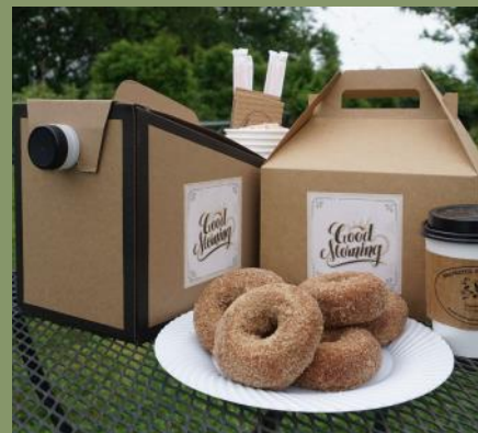
coffee & donuts to go