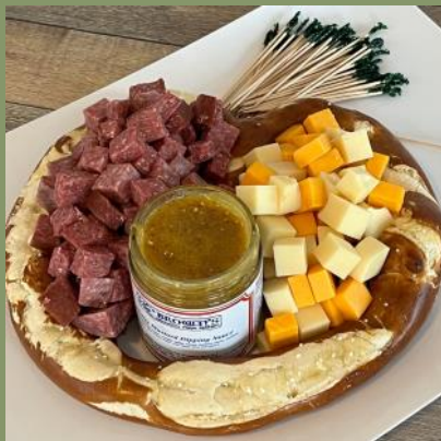
tying the knot

Your choice of 2 flavors - Hot, Mild, BBQ, Old Bay or Teriyaki. Includes Celery and Ranch or Blue Cheese Dressing. (65-70 wings)