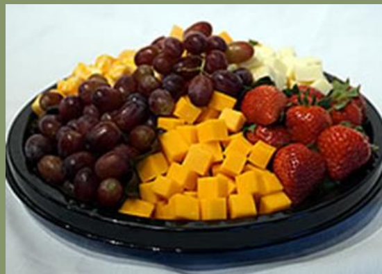
fruit & cheese tray