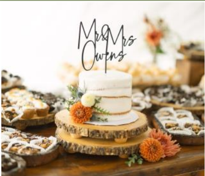
Table Linens & Napkin Rentals Dinnerware Rental Fully Insured Bartender Brown's Catering and Bakery

We are happy to facilitate rental/services of the items below. Please ask for prices.